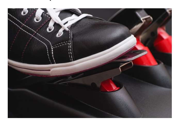
Error 3: Keep Your Foot on the Pedal

Another big mistake vendors make when they decide to sell is taking their foot off the pedal. They relax, scale back their marketing spend, and the business slows. As you know, it can take months or even years to sell a business and buyers will gravitate away from a business in decline or they will look to negotiate the price down.